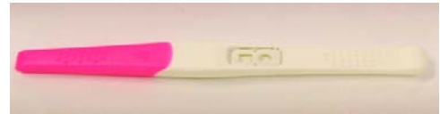
Midstream Test Wand

colored band at the control region will always appear, regardless of the presence of FSH.